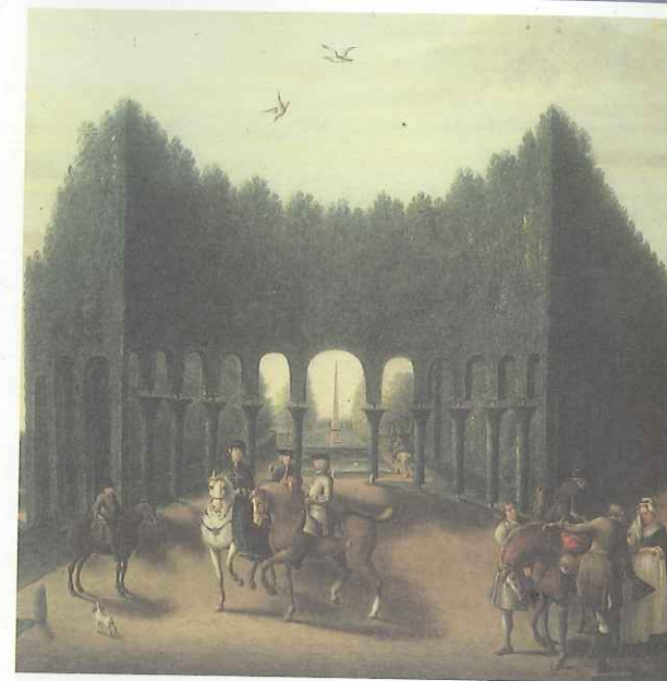
Garden of Hartwell House by Balthasar Nebot 1738

Patrons of the Buckinghamshire Art Gallery