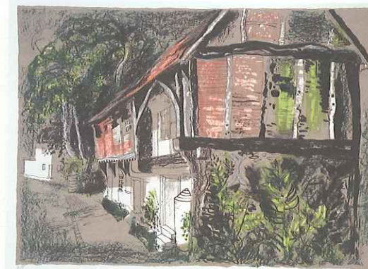
Long Crendon Court House by John Piper